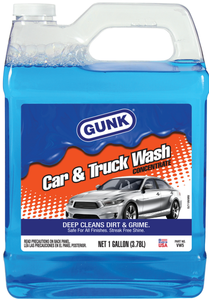
Plastic Jug, 128 fl. oz. 078698102115