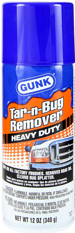
TR1 Aerosol Metal, 12 oz. 078698201818